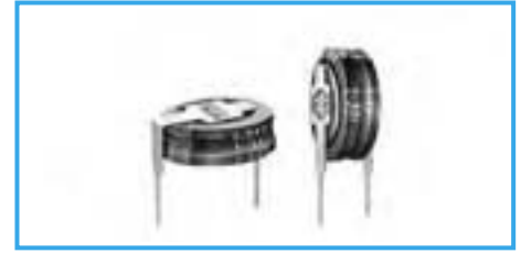
Marking color : White print on a black sleeve