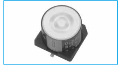
Marking color : White print on an brown sleeve