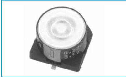
Marking color : White print on a brown sleeve