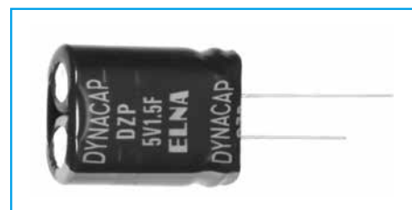
Marking color : White print on a blue sleeve