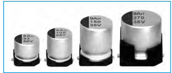
Marking color : Blue print